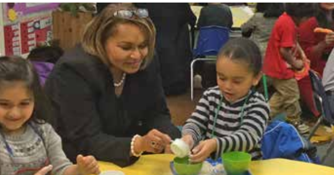
Family STEM Night, UCM Early Learning Center